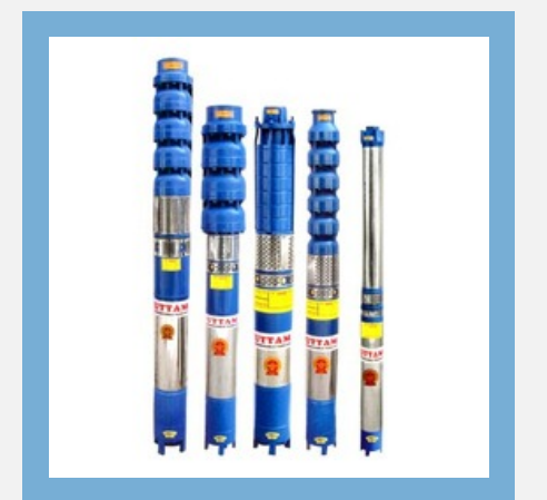
Bore Well Submersible Pump