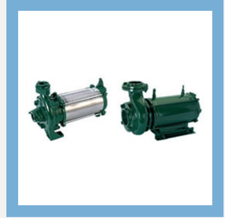
Horizontal Open Well Submersible Pumps