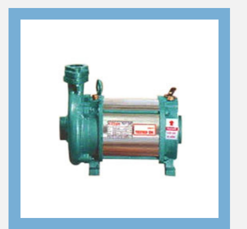
Open Well Horizontal Monoset Pumps